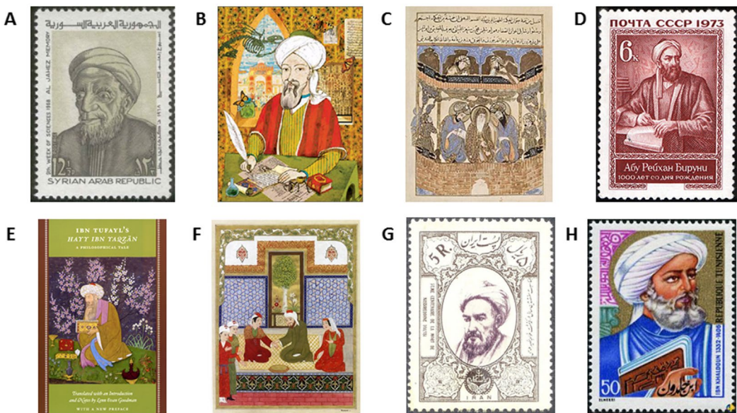
Figure 2. Key pre-Darwin Muslim scholars with evolutionary ideas: (A) Al-Jahiz (776–868; Boulter 2013); (B) Ibn Miskawayh (930–1030; DailyNews 2010); (C) The Ikhwan Al-Safa (tenth century; Wikipedia 2015b); (D) Al-Beruni (973–1048; Wikipedia 2015a); (E) Ibn Tufayl (1110–1185; University of Chicago Press 2009); (F) Nidhami Arudi (twelfth century; Muslim Heritage); (G) Tusi (1201–1274; Wikipedia 2015c); (H) Ibn Khaldun (1332–1406; Ahmedullah 2014).